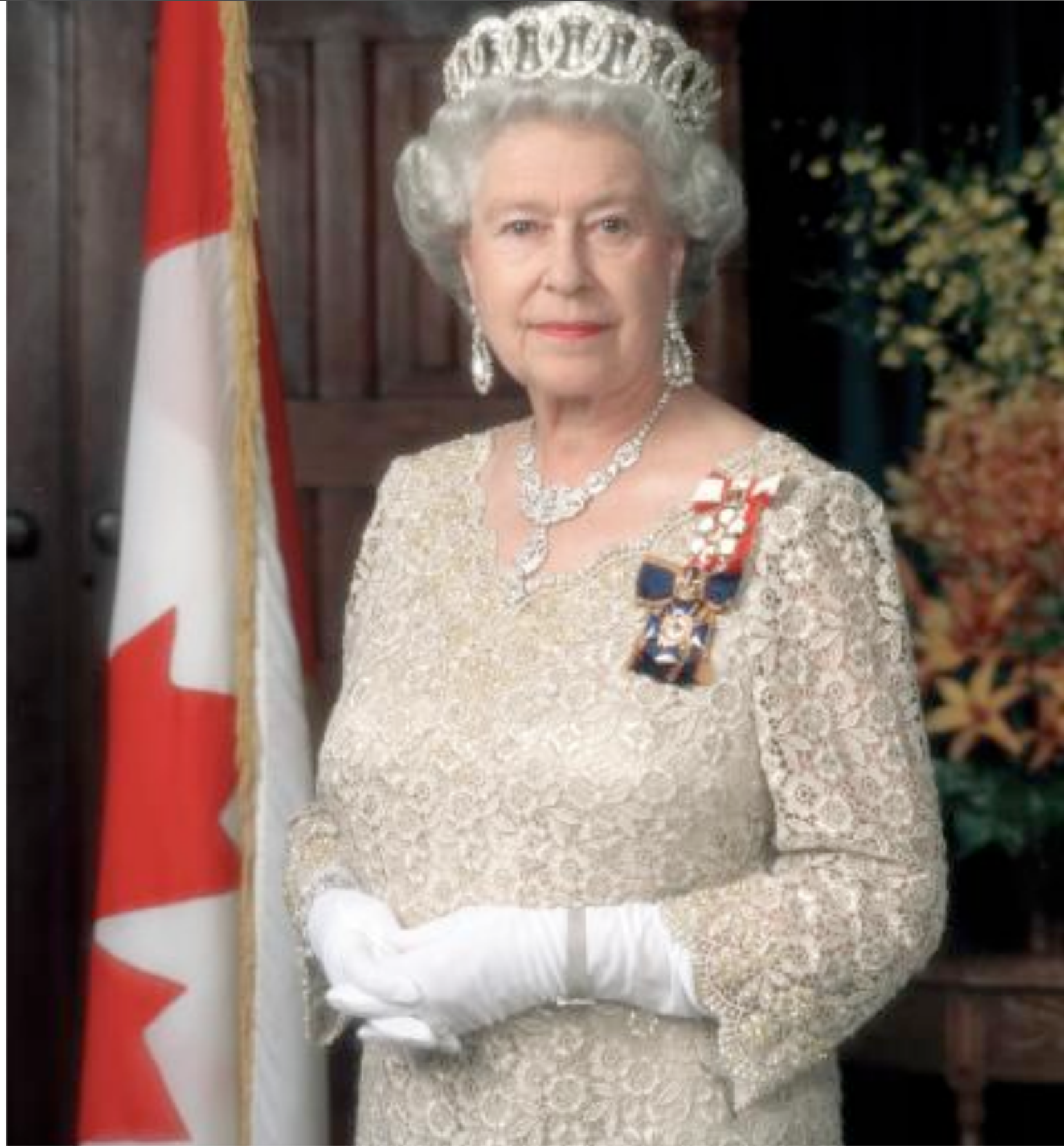
Elizabeth II: Queen of Canada